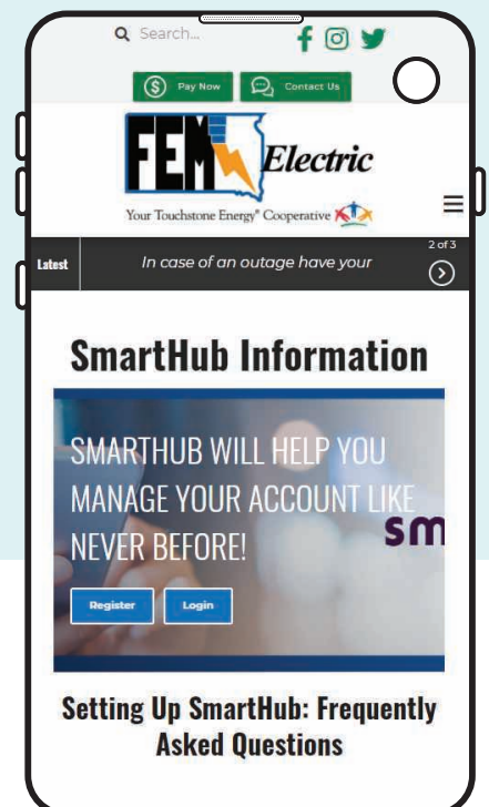
HOW THE NEW FEM SITE MAY LOOK ON YOUR MOBILE DEVICE