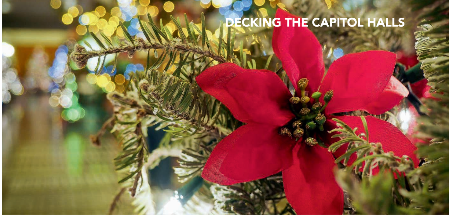
Nearly 100 trees are decorated by clubs, associations, non-profits and government agencies.

an audience in this kind of setting. It's very intimate and not like playing on a stage in a large theater where the audience is sitting at a distance away from you," she said. "In the Rotunda, there are people all around, sometimes standing room only, and they're very close and intimate. It's an emotional time of year and you get to really connect with the audience. At the same time, they have to be disciplined and focused on what they're doing. It's a unique experience that a lot of students don't always get to have."