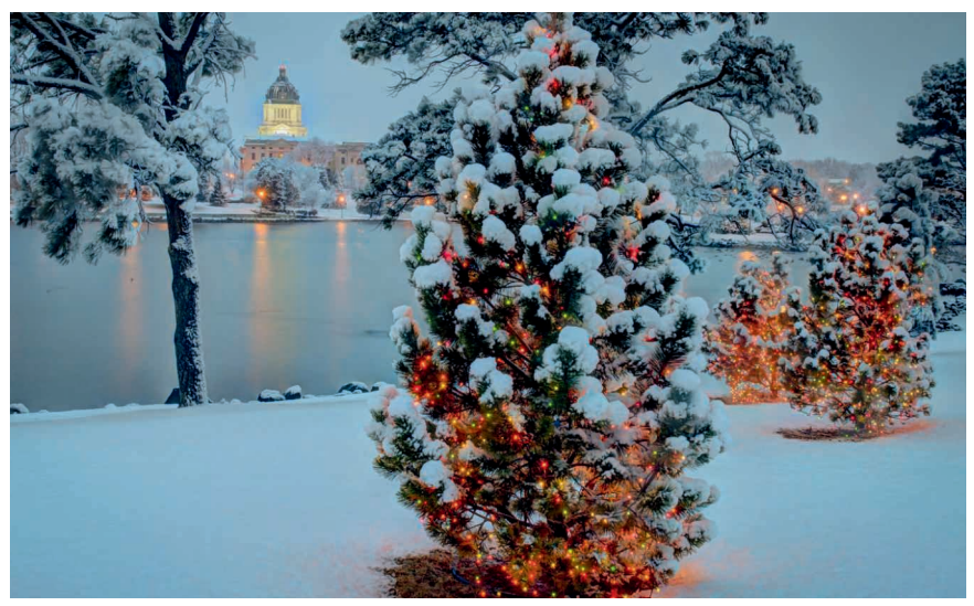
The State Capitol grounds are also decorated to evoke the spirit of Christmas.

Those interested in serving as a volunteer for the event can contact rick.augusztin@state.sd.us.