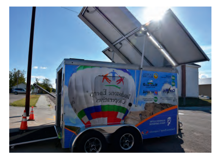
The solar trailer has been featured at several co-op public outreach events.

More than 30 members participate in the subscription program, and because the project was entirely financed by the participating members, it won't impact other members of the co-op.