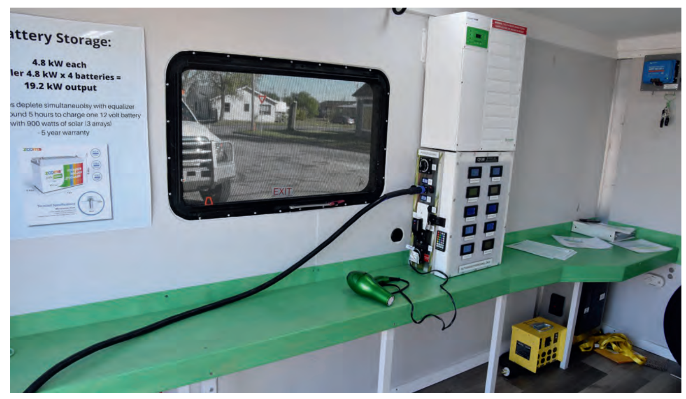
The interior of the solar trailer is equipped with battery storage and outlets – powering everyday electrical appliances, such as a hairdryer.

The landscape of renewable energy is vast and ever-changing and every co-op is planning their own approach, but with resources like the solar trailer, tools for education and engagement are within reach for members wanting to learn more.