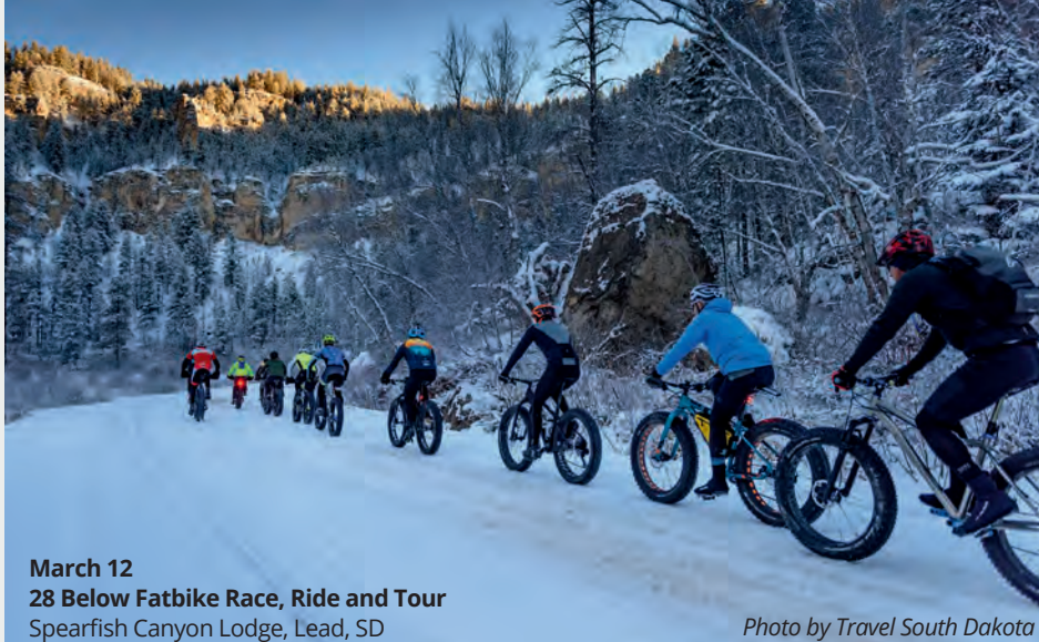
March 12 28 Below Fatbike Race, Ride and Tour Spearfish Canyon Lodge, Lead, SD