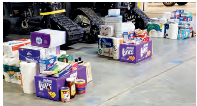
Donations from pancake breakfast separated and ready to be delivered to local food pantries in Faulk, Edmunds and McPherson counties.