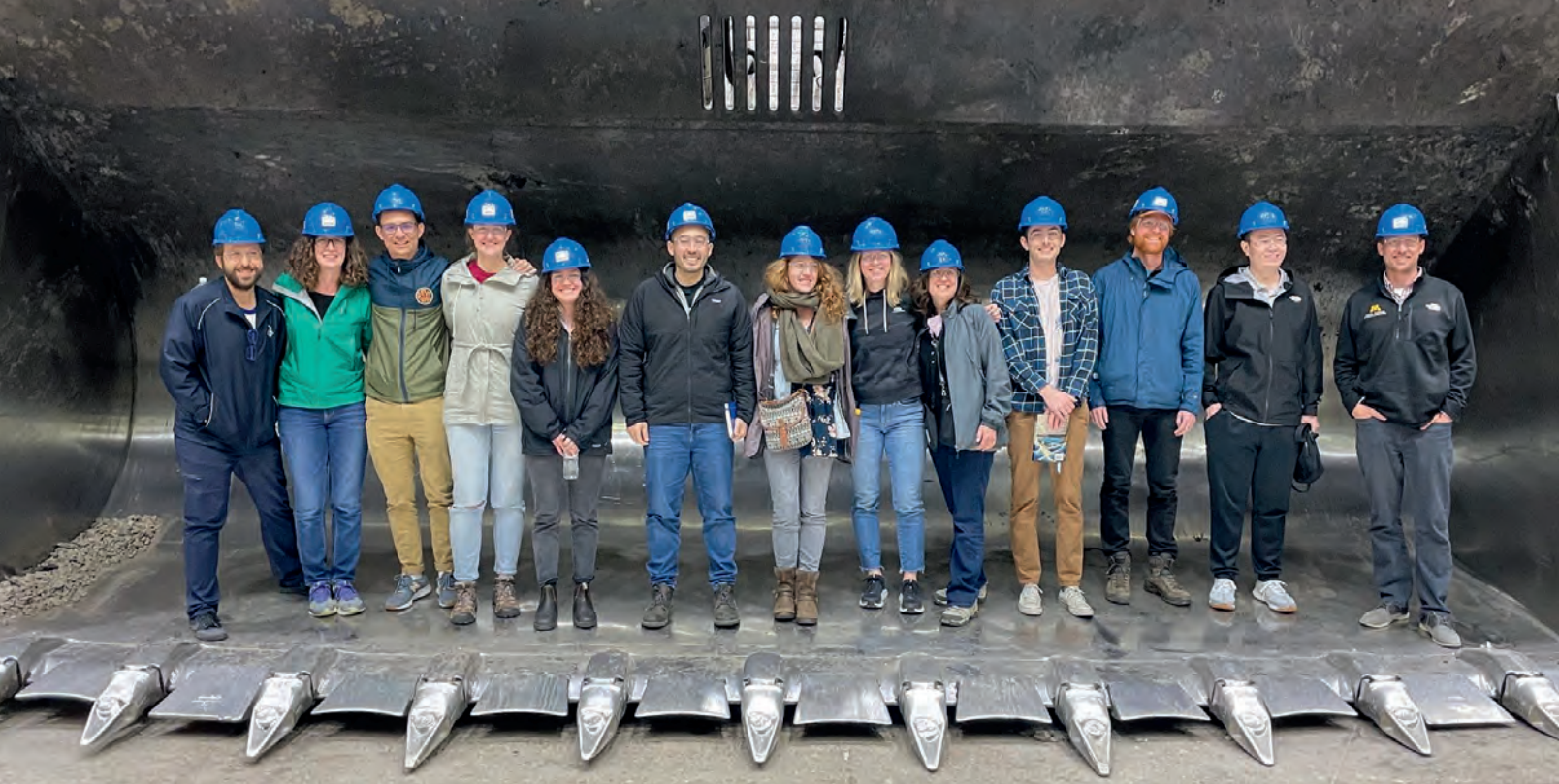
University of Minnesota graduate students pose in a massive coal bucket during an electric cooperative tour sponsored by Renville-Sibley CPA and the university.