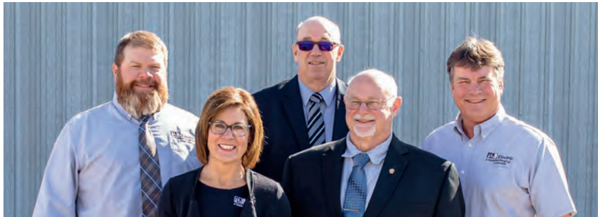
Your FEM Electric Board of Directors