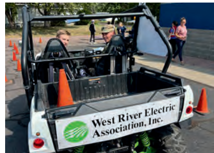
West River Electric is one of several electric cooperatives that support the Freshman Impact program.

The morning session included seven separate stations scattered throughout the school's parking lot and in the gymnasium. The learning stations focused on the following subjects: teen mental health; healthy relationships; jaws of life and ambulance demonstration; seatbelt awareness; drug dog; social media dangers; and a distracted driving course where the