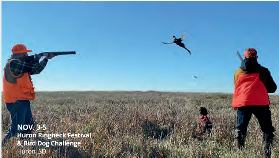
NOV. 3-5 Huron Ringneck Festival & Bird Dog Challenge Huron, SD

To have your event listed on this page, send complete information, including date, event, place and contact to your local electric cooperative. Include your name, address and daytime telephone number. Information must be submitted at least eight weeks prior to your event. Please call ahead to confirm date, time and location of event.